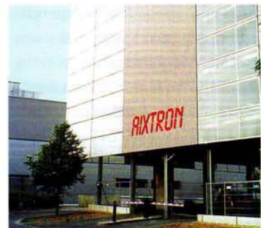
Best references: Aixtron is one of Wahlen's content clients