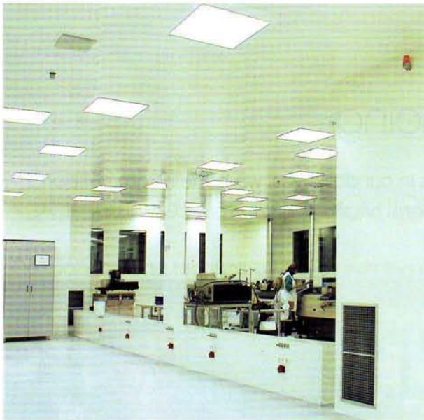
Steel Form manufactures structural parts and furniture for clean rooms

ceive approaches from prospective clients."